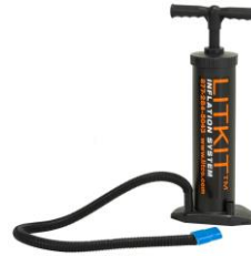
LITKIT® PRO Inflation System™ with the blue Turbo Flow nozzle tip.