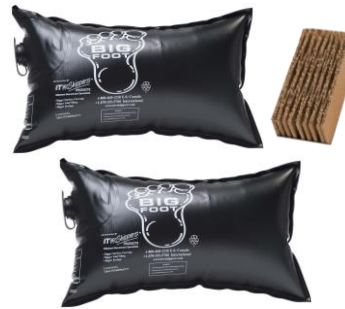
LITKIT® PRO KIT (not including Inflation System™) Two bags at 12 x 20, One 3 inch Corrugated Block