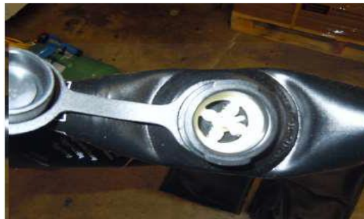
Air bag valve: Turn white stem until it pops up and seals closed. Stem rotates open & closed.

Front Load Washer: Remove top to access drum for bag placement. Some models can only be accessed by removing the rear panel. Only two air bags may be required on those machines.